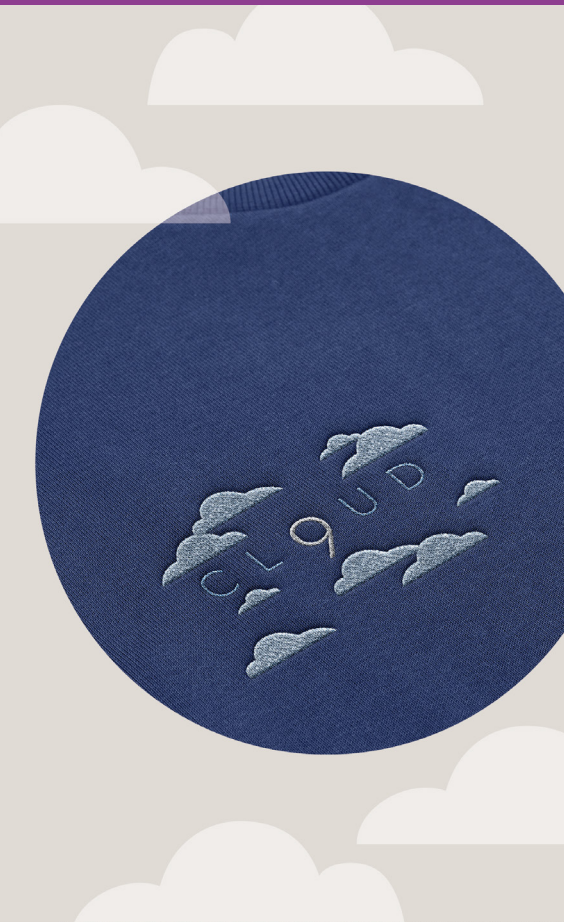
Student work: Top - Alicia Oswald, Bottom - Erin Mckinley

Gain knowledge of digital animation, animation principles, animation workflow and conveying meaning to a specific target audience.